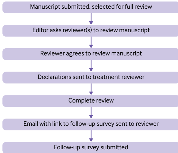
Fig 1 | Study flow

Our secondary data source was reviewers' responses to the follow-up survey sent in the second phase of the study. The counterfactual score was the primary outcome measure of the follow-up survey (appendix 5). We also assessed several additional measures (exact text of items in appendix 5); reviewers in the treatment arm were asked whether they had noticed